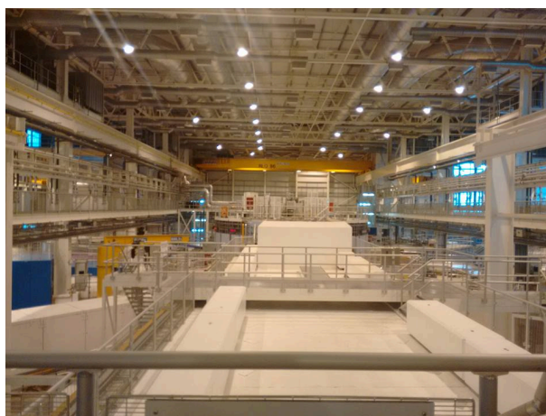
ISIS in RAL

Next, there was the first of three career panels where we got to listen to various women's career stories and ask questions. It was nice to actually be able to speak to someone that had already been through everything we are going through now and be given advice. Most of the questions were about careers and touched upon any difficulties that women had experienced in the field of science just for being women. It was nice to see that most had not experienced much gender bias throughout their career, especially the younger women which reassured us that the STEM field is definitely open to men and women.