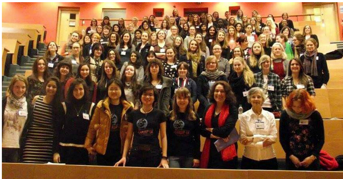
All of the girls that attended the conference with the organisers.

I definitely think that funding should be available if this conference is ran next year and I would highly recommend people to apply as it has really changed my view on physics as a career - there are so many different options available that I hadn't even contemplated - and it was amazing to hear the stories from successful women in physics and actually be able to relate to the struggles that they had.