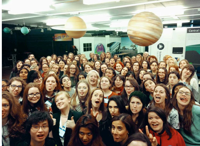
Group photo in RAL